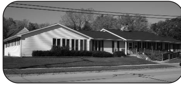
Our Place, a community based residential facility in Green Bay, Wisconsin, serving adults with mental or emotional disorders.